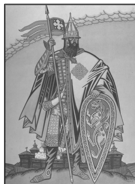
Cover image: Costume design by Ivan Bililbin for the opera Prince Igor (1929)